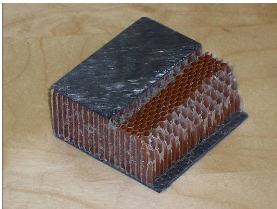
Cutaway of a test sample similar to a bulkhead showing Nomex sandwiched between layers of prepreg carbon fiber.

First the hull and deck core material will be primarily Nomex ® which is made from Kevlar ® in the form of a honeycomb. The Nomex ® material looks very much like corrugated cardboard. It is much lighter than the closed cell foam that has typically been used for custom boat construction.