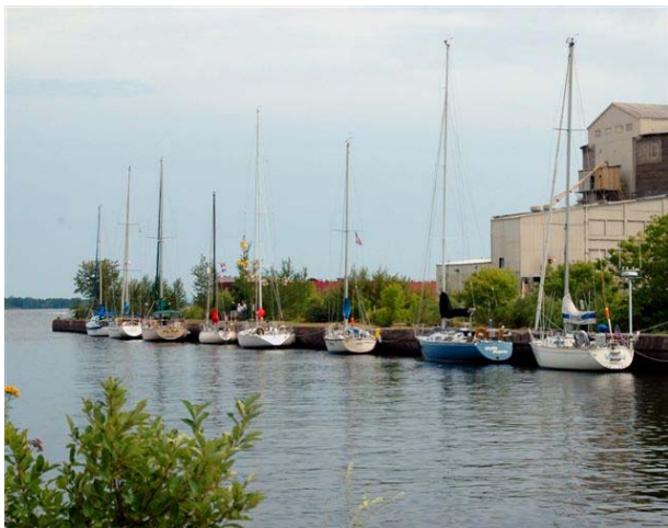
Slip Number Two in Duluth - Perfect for Listening to Jazzfest!

As the sun rose, wind started to return, but it wasn't steady and served to only rise, then dash hopes of a daytime finish in Duluth. Speeds of eight knots came and went, only to be replaced by indications of less than one,