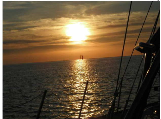
Chase is On...

Strangely, the race seemed to go by pretty quickly, and whether or not I was more focused because of my