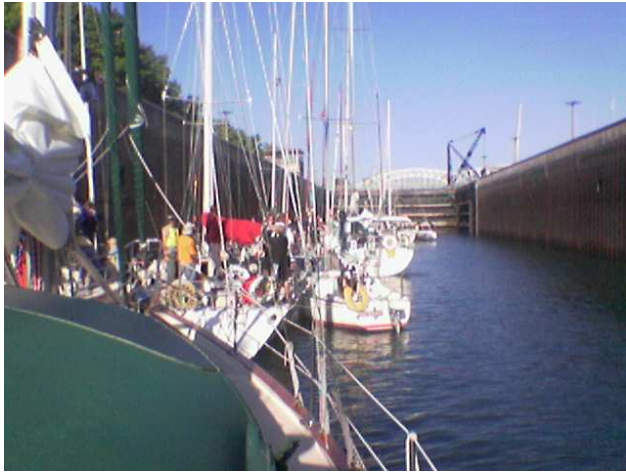
Locking up in the MacArthur Lock

From the locks, it is roughly an hour's motoring out to the starting line near the Gros Cap Light. Jim McLaren's son Justin on patrol with the USCG Station Sault not only gave us a proper Coastie welcome, but also kept the starting area clear of the many other boaters who wondered what so many sailboats were doing on such a windless day. And windless it remained through the start, as it took better than half an hour for all of the boats just to cross the starting line. Happily, the breeze began to fill in from the SW, and spirits rose considerably as the racers headed out into Whitefish Bay.